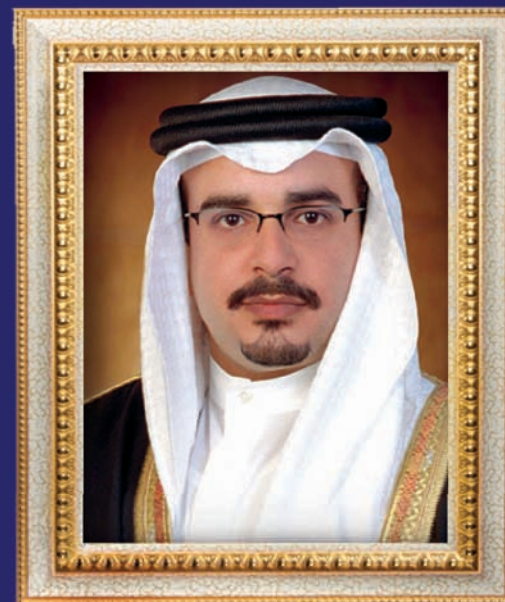
H.H. Shaikh Salman Bin Hamad Al-Khalifa Crown Prince & Deputy Supreme Commander of the Bahrain Defence Force