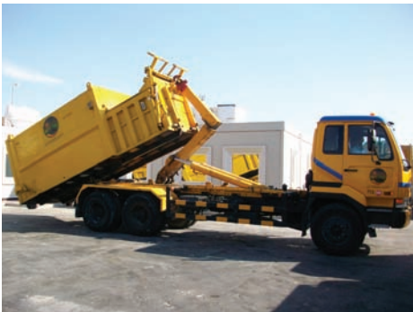
This is one of our two Nissan Trucks 6x4 fitted with Palfinger hook loading system. shown with a Large 18 cubic meter static compactor.