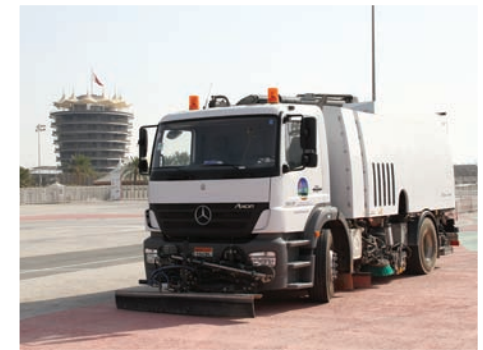
In December 2010 GCCC was awarded a 4 year contract for track cleaning services at BIC. This contract required 2 specialist machines from Beam in Denmark.