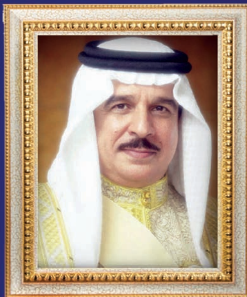
H.M. King Hamad Bin Isa Al-Khalifa King of Bahrain