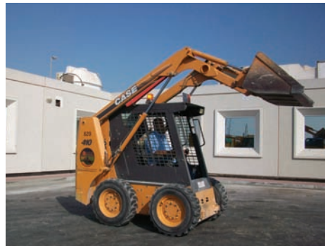
This is an example of our Skid Steer loaders. They are very versatile units used for open land clearance.