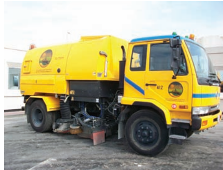
This is one of six of our Johnston 650 sweepers. These are very versatile and can be utilised to sweep any roads, car parks open areas.