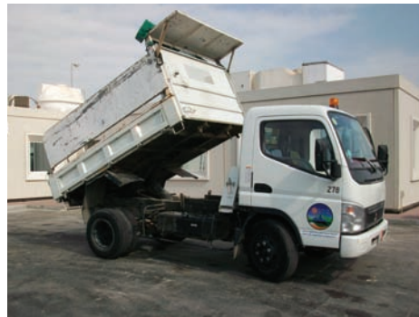
This is an example of our fleet of tipping six wheels. These are utilised to remove loose, bulky garden waste.