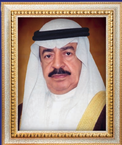
His Royal Highness Prince Khalifa Bin Salman Al-Khalifa The Prime Minister