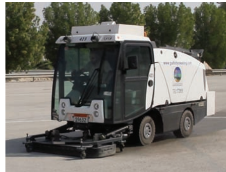
This is a compact washer from Beam in Denmark. It high pressure washes & vacuums paved areas used on our contract at Bahrain International Circuit.