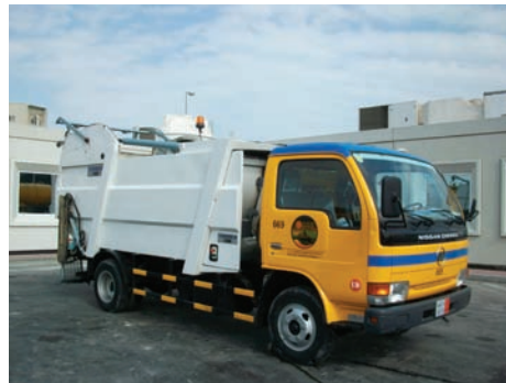
In our waste collection fleet, we now have 6 of these Nissan 4x2 chassis, used in narrow area, such as souques etc.