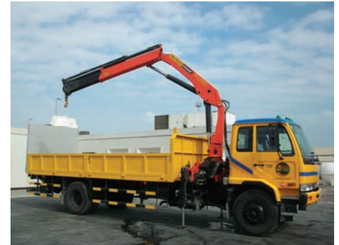
This is one of our most versatile vehicles a large Nissan 6x4 truck fitted with a Palfinger crane.