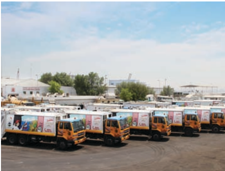
This picture shows our Yard at Mina Salman Industrial Estate where vehicles are parked after work and all washed.