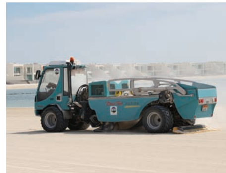
This is a recent addition to our fleet from June 2010. We use it to clean and groom beaches on one of our contracts.