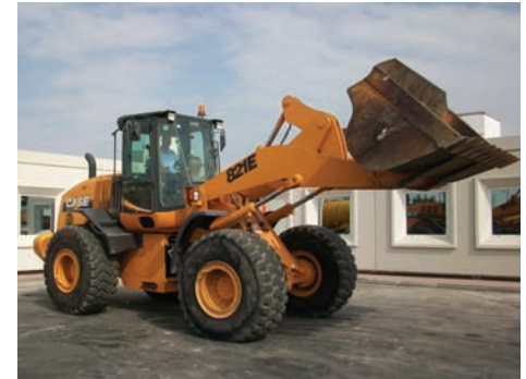
This is one of our seven loading shovels mainly used for open land clearance. All loose rubbish is moved in tippers to the landfill site at Asker.