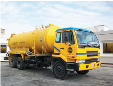
This is an example of our fleet of waste water vacuum tankers. These vehicles remove waste for disposal at Tubli Plant.