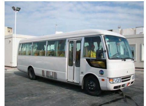
GCCC also has a fleet of Mitsubishi Rosa buses, which are used for labour transport on our Municipal contracts.