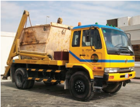
This is one of our fleet of Skip Loader trucks with skip on board. 7.5 cu m skips are available to hire.

In order to provide 24 hour service to its clients, GCCC acquired top calibre professionals, modern vehicles and equipment, which are maintained professionally. All our fleet is fitted with a GPS system. With this real-time information at their fingertips, managers can make quick and efficient decisions that result in improved business operations and helps to cut down fuel consumption, time loss and overtime costs. Further, this turns out to be a value addition to our business by improving the level of efficiency and quality of service we can provide to win customer satisfaction.