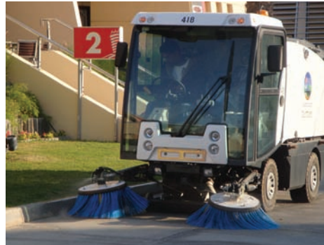
This is one of six of our Johnston CN200 sweepers. These are very versatile.