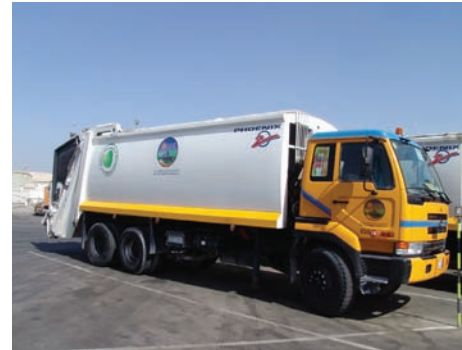
This is the backbone of our waste collection fleet we now have 33 of these Nissan 6x4 chassis.