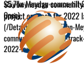
3 regional premieres for Mercedes-Benz at Dubai-show