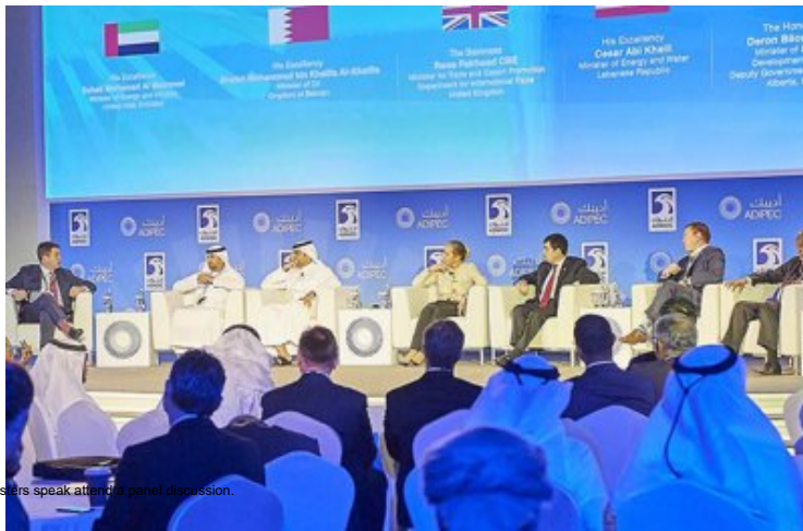
Oil ministers speak at a panel discussion.

Bahrain's Oil Minister Shaikh Mohammed bin Khalifa Al-Khalifa is leading the Bahraini delegation at the Abu Dhabi International Petroleum Exhibition and Conference (Adipeec) this week.