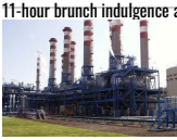
Abu Dhabi starts commercial operations at $15bn-gas-turbine-plant